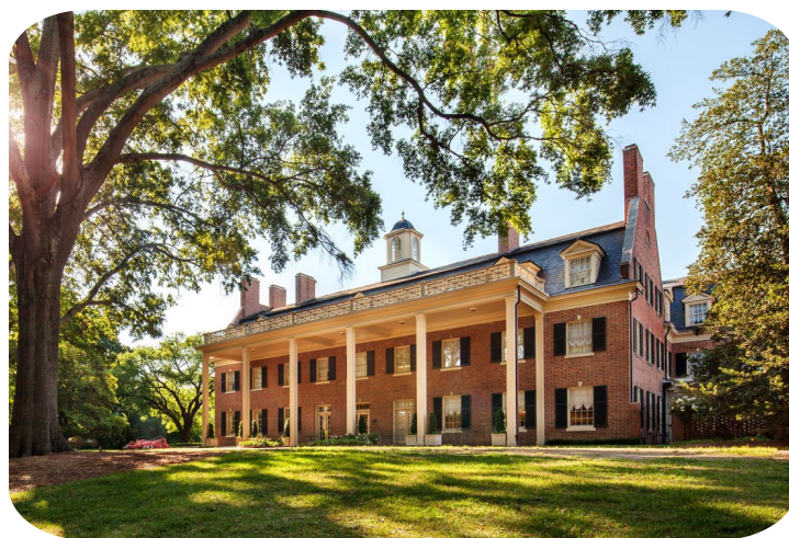
The Carolina Inn - Chapel Hill, NC

The Leader's Roundtable builds your personal effectiveness and your company's bottom line. Apply today!